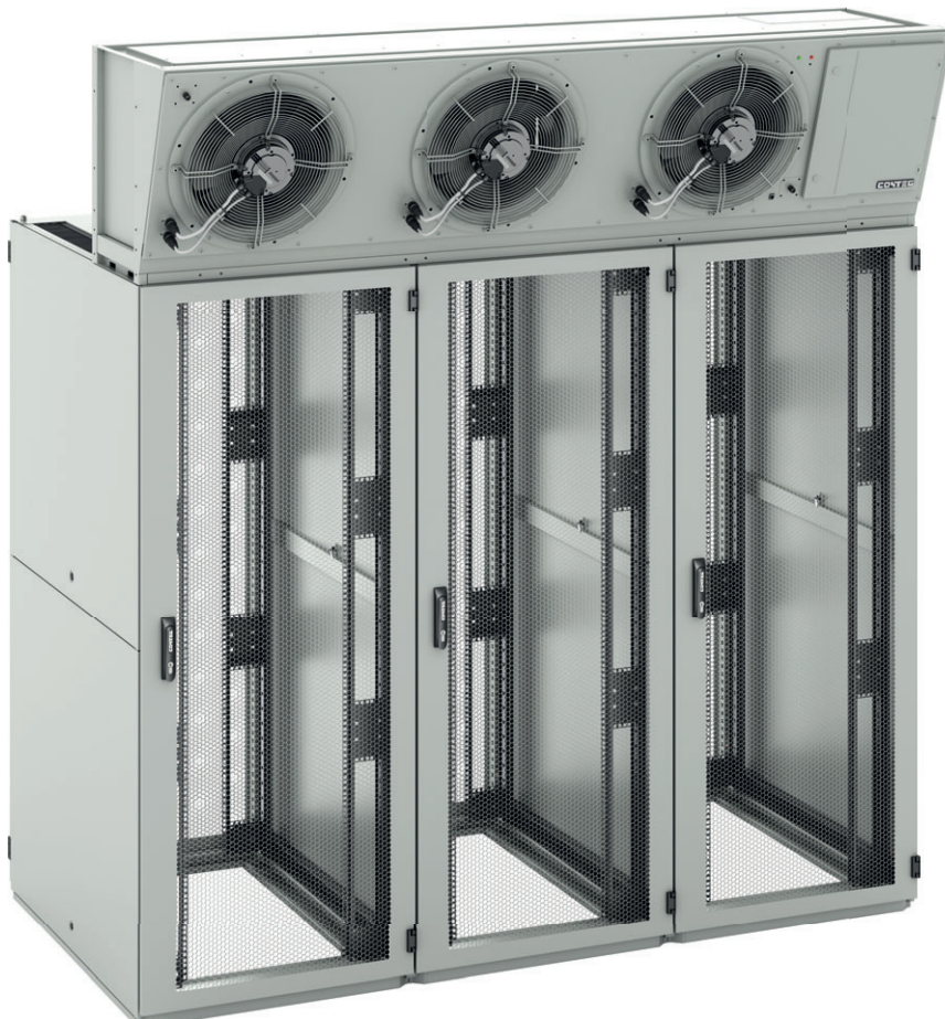
3× RF1-42-80/12A in RAL 7035 color, with CoolTop cooling unit on the top.