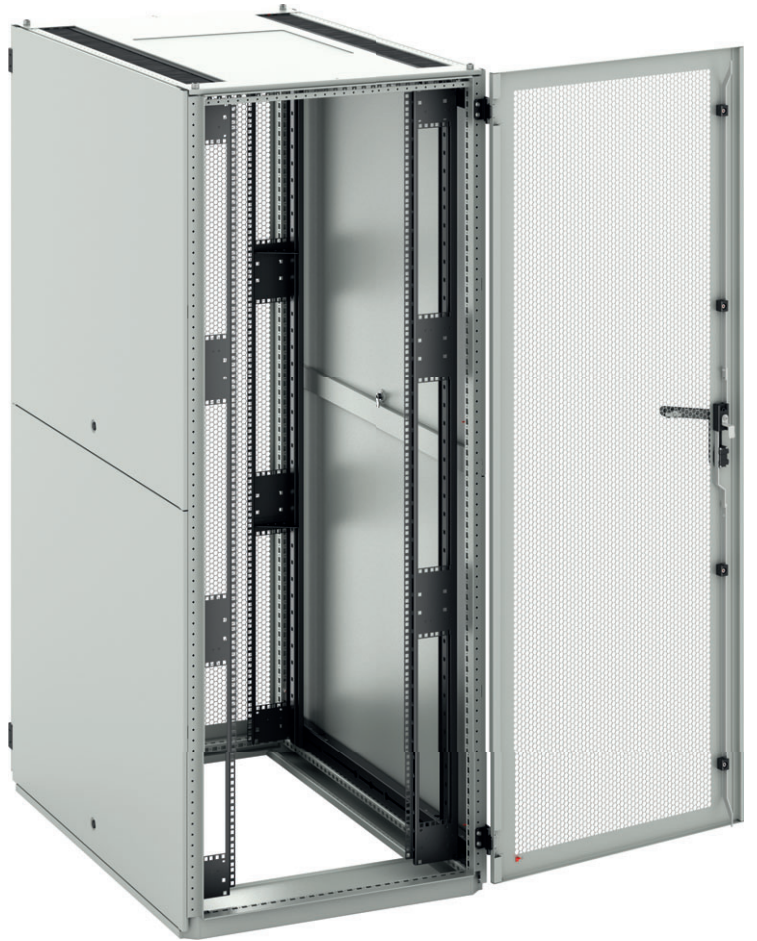
RF1-42-80/12A in RAL 7035 color, with opened front vented door (86 % door perforation ratio) with multipoint swivel handle lock.