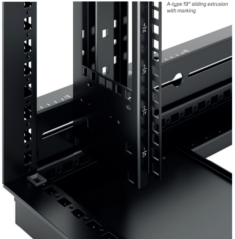
A-type 19" sliding extrusion with marking