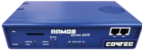
RAMOS Ultra ACS

The intelligent monitoring system is used to control the state of the environment (temperature, humidity, water leakage, smoke,...) in large data centers, server rooms, or individual racks. RAMOS can be also used for access control.